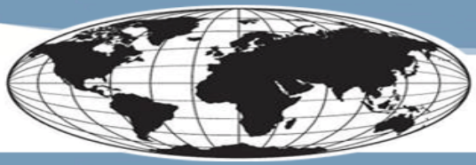
Anvisa's GMP Certification 2018